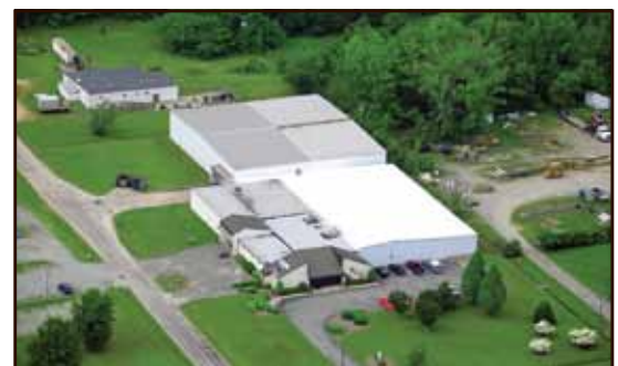
Cobbs Creek, VA • Production Facility • 40,000 square feet