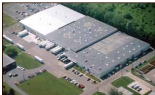
Coshocton, OH • Production Facility • 150,000 square feet