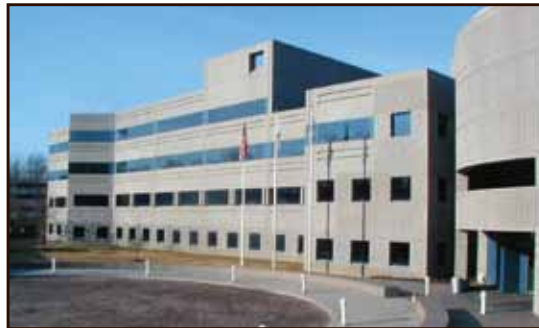
Roseland, NJ • Annin Flagmakers' Corporate Headquarters

Annin Flagmakers plans to extend its flag-making tradition well into the 21st Century and is committed to expanding and upgrading its manufacturing and distribution capabilities. With promises to its customers to make the best quality products and to offer the best levels of service, Annin Flagmakers anticipates retaining its position as America's largest manufacturer and distributor of U.S. flags for the indefinite future.