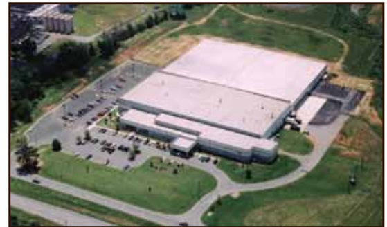
South Boston, VA • Production Facility • 180,000 square feet